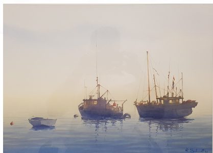
'Morning Fog - East Coast Tasmania'

Fred Schmidt (born January 12 1945) is an Australian watercolour and oil paint artist who specialises in painting landscapes and harbours, especially boats with reflections.