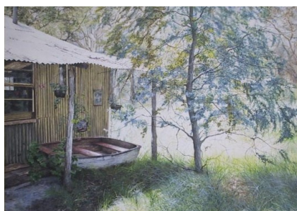
'Just Off The Track'