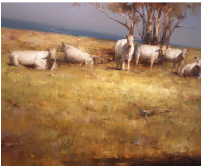
'Coastal Landscape' Oil 1040 x 930 cm Rotary Art Show 2007