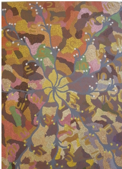
'Purpalangi Jukurrpa Bush Vine Dreaming'