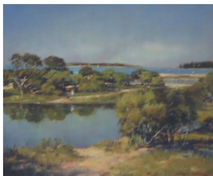
'A Victor Harbor Morning'