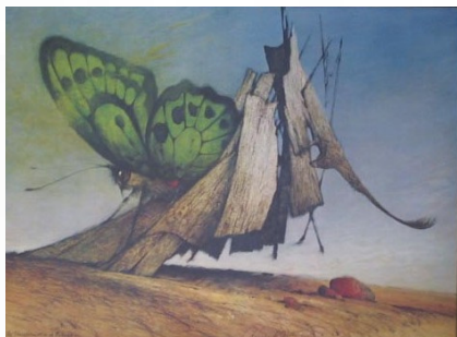
'The Transformation Of Burnba'