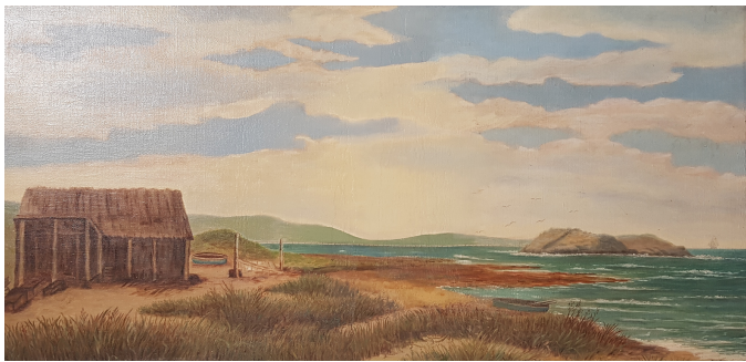
'View to Granite Island'