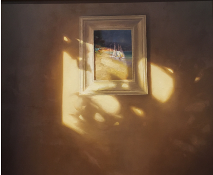
'Shadow Play' Oil 940 x 790 cm Rotary Art Show 2004