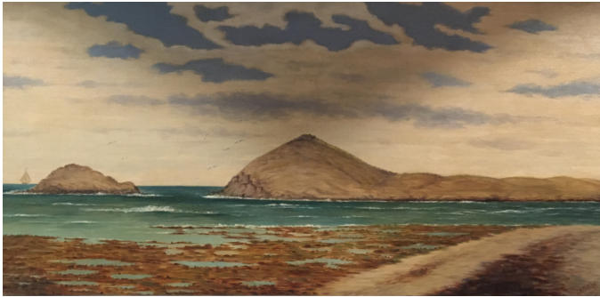
'The Bluff Encounter Bay'

The origins of these paintings, the artist and how they came into Council's possession is unknown.