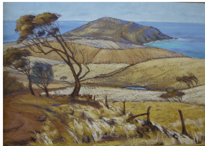
'The Bluff in Summer Dress'